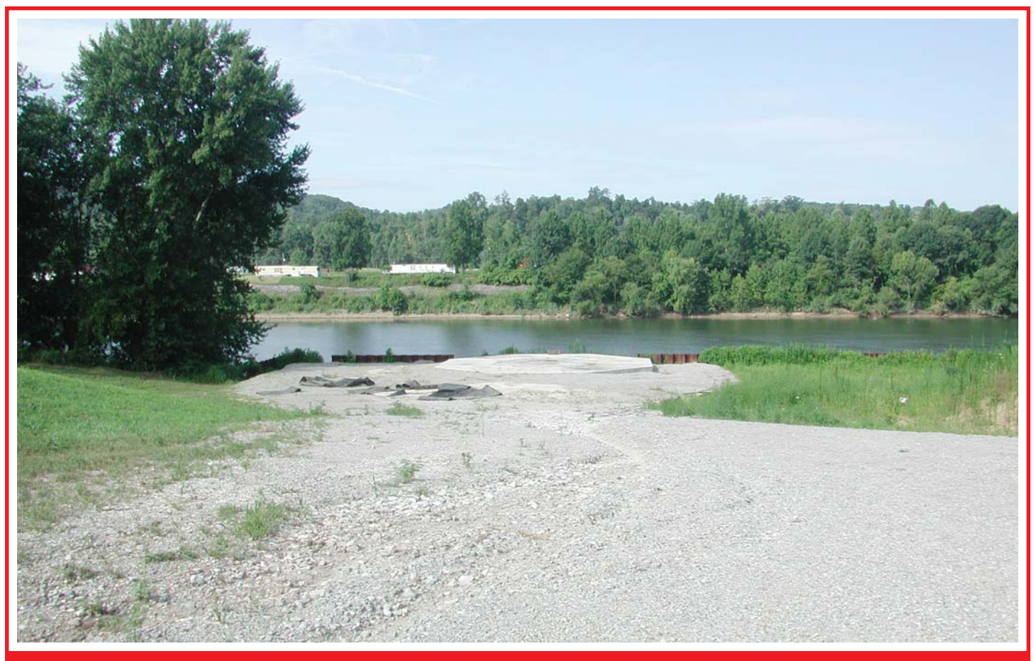
BARGE FACILITY SHOWING CRANE PAD