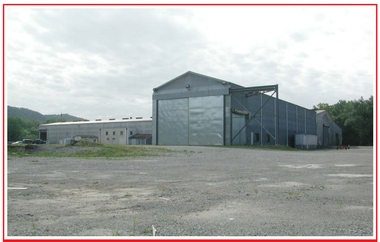
PAINT SHOP SHOWING LARGE SLIDING DOORS