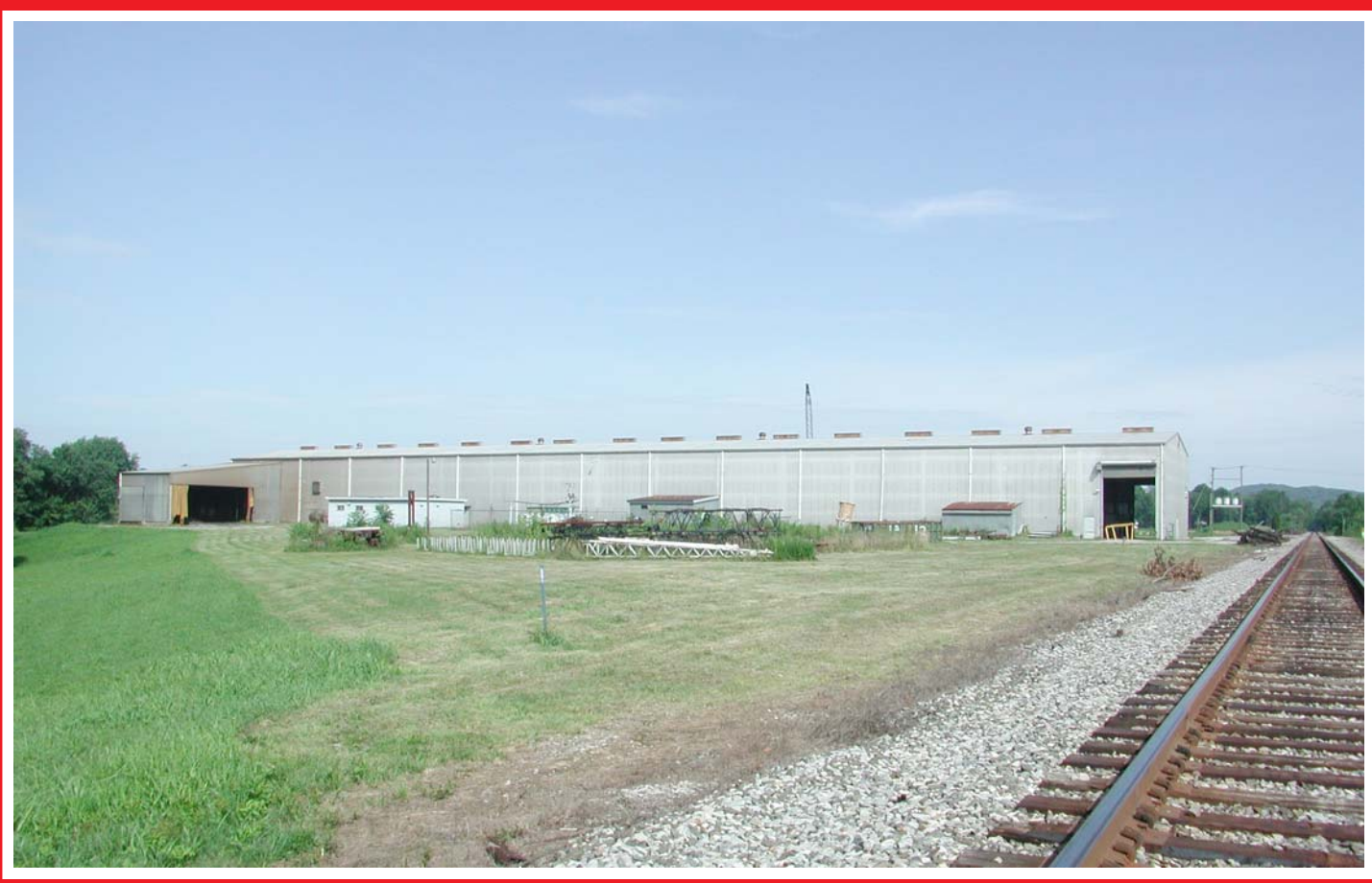
REAR OF BUILDING, RAIL SIDING FEASIBLE