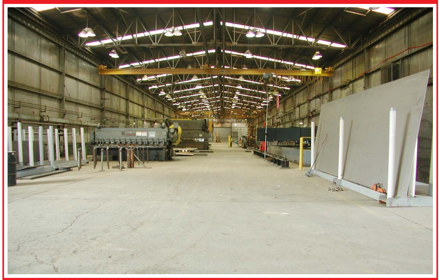
MAIN SHOP LOOKING IN OPPOSITE DIRECTION