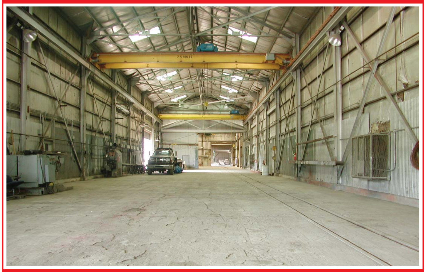
PAINT SHOP LOOKING IN OPPOSITE DIRECTION (TWO 7.5 TON CRANES)